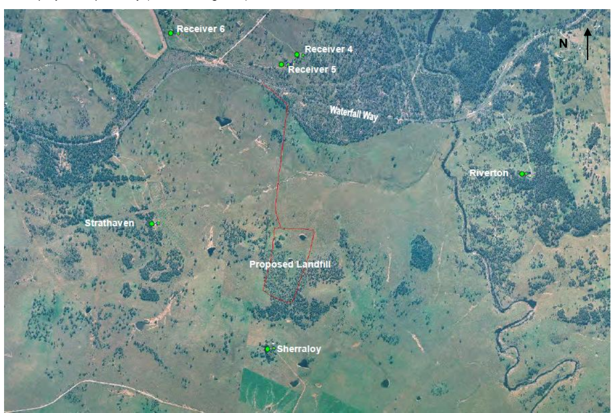
Figure 2 Location of nearest noise receivers

The nearest residential properties, Strathaven and Sherraloy are located 950 metres west and 410 metres south of the project respectively (shown in Figure 2).